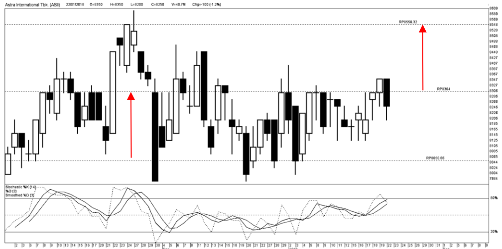
Kinerja saham ASII

Danareksa research report are also available at Reuters Multex and First Call Direct and Bloomberg